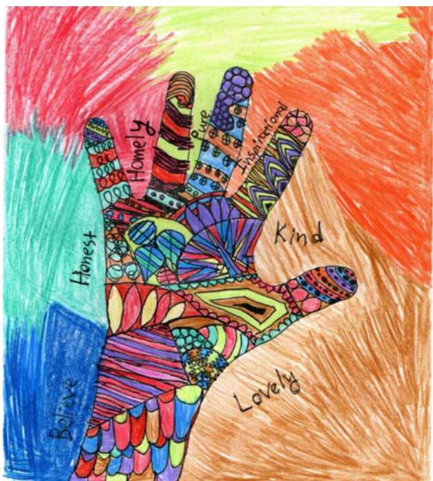
Georgiana, 8, Saudi Arabia

Thank you for your hand shaped doodles in Art Club last month! Here's some of your creative entries.