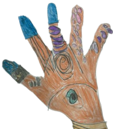
Kian, 7, India