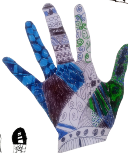
Lily, 8, New Zealand