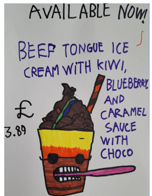
Jacques, age 8, ice cream poster design