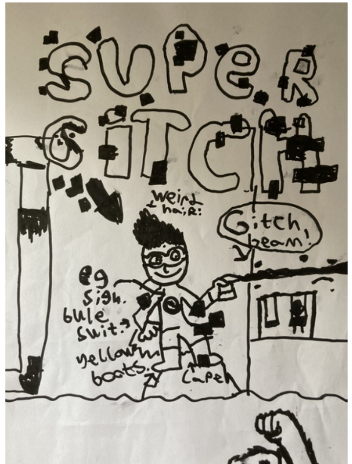
Luca, Year 5, Super Glitch