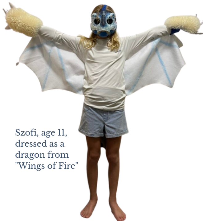
Szofi, age 11, dressed as a dragon from "Wings of Fire"