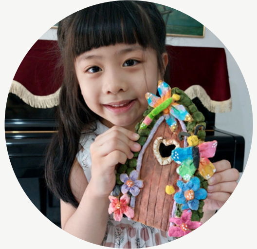
Evie, 7, Indonesia