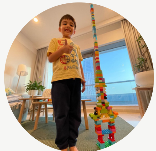
James, 6, Thailand