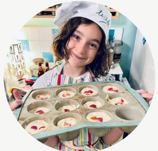
Atica, 9, Mozambique