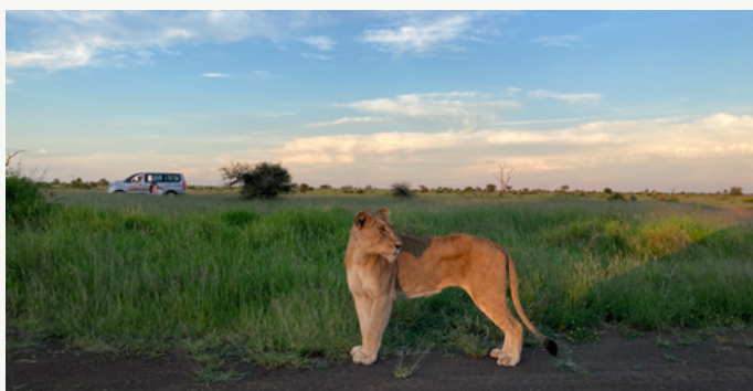
Marita, South Africa