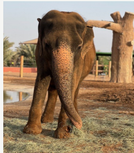
Jana, Saudi Arabia