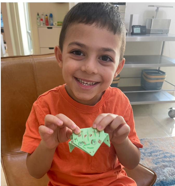
Ziyad, age 5 from UAE, made an origami frog in last month's Art Club.

Photography: Imagine you are a food photographer. Time to get snapping for that recipe book!