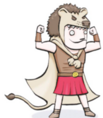
HERCULES THE HERO