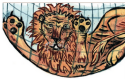
THE UPSIDE DOWN LION