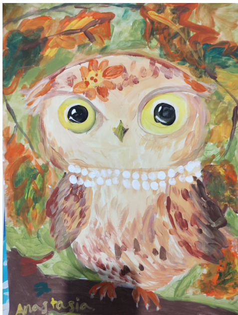
Anastasia, age 9, Ukraine