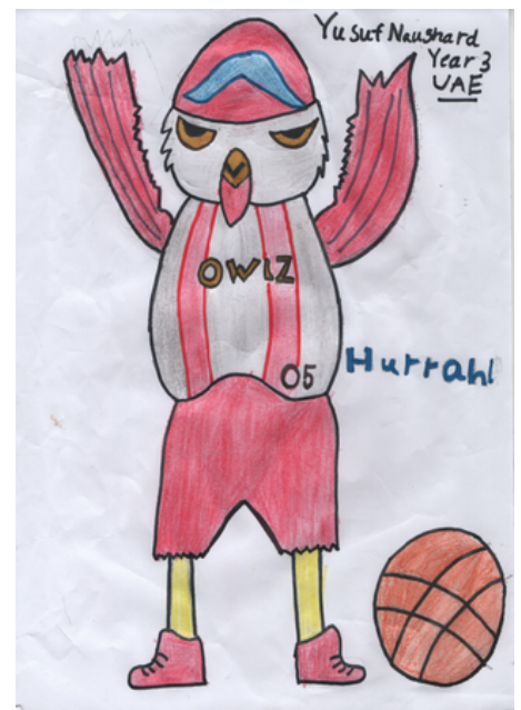
Yusuf, age 7, UAE