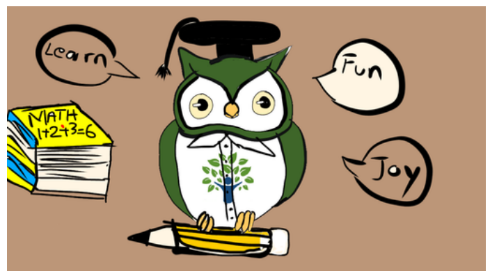
Eisa, age 7, Saudi Arabia