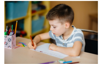
Creative Writing Club